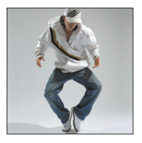
Examples: running, hopping, skipping, jumping rope, swimming, dancing and bicycling.