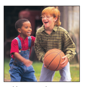
Examples: running, jumping rope, basketball, tennis and hopscotch.